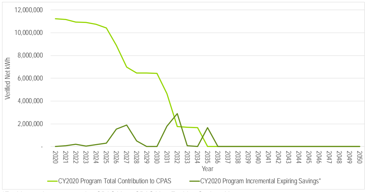
Figure 4-1. Cumulative Persisting Annual Savings

*Expiring savings are equal to CPAS Y_{n-1} - CPAS Y_n + Expiring Savings Y_{n-1} .